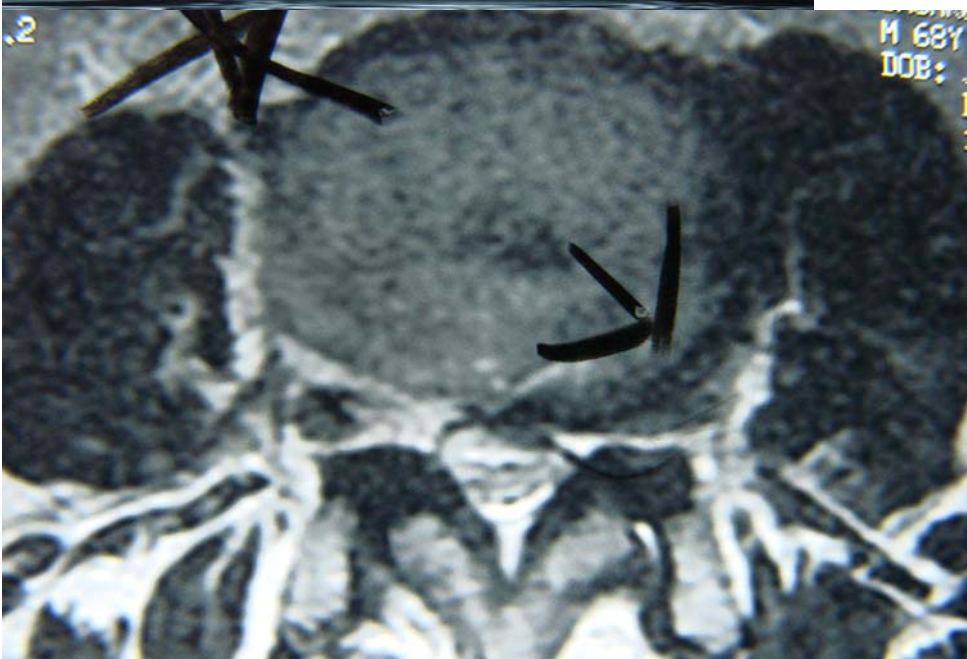
Figure 2: This is the L3-4 disc level. Note the far lateral disc herniation with endplate hypertrophy extending into the osseoligamentous canal and lateral to the canal creating spinal stenosis. The L4 nerve root and L3 dorsal root ganglion are compromised. The L4-5 axial images did not reveal such stenosis.

He is referred to a neurosurgeon by his family doctor who recommends surgery to remove the L3-L4 far lateral disc herniation.