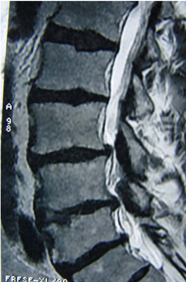
Figure 1: Note the disc degeneration at all lumbar levels, but especially note the spinal stenosis at the L3 thru L5 levels by disc protrusion and ligamentum flavum hypertrophy at the L3 and L4 levels resulting spinal stenosis of the sagittal vertebral canal diameter. There is also small L5-S1 disc protrusion noted.

This 68-year-old white male is seen for the chief complaint of left anterior thigh pain, weakness of the quadriceps muscle, and difficulty sleeping due to the pain. The pain is listed as an 8 on a VAS scale. This pain started approximately three weeks previously for no apparent reason, and he sought care from his family doctor who ordered the MRI shown in figures 1 and 2.